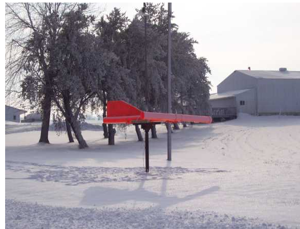
The new wind tee at work.