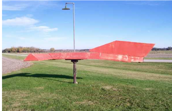
Here's how it looked before.